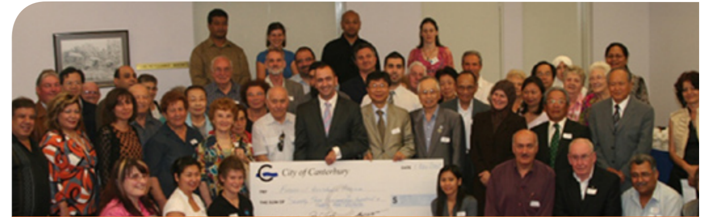
Each year we distribute grants to local community groups and associations through our Financial Assistance Program.