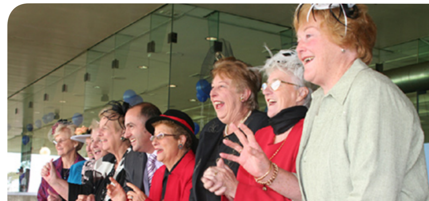
Seniors enjoying our Seniors Week celebrations at Canterbury Park Racecourse.

Multicultural events and programs were facilitated throughout the year including the 2008 Youth X Festival, Artstart Music Program, Newly Arrived Young Women's Group, Releasing the Fear workshops and the Pacific Cultural Performances and Whakairo Workshops.