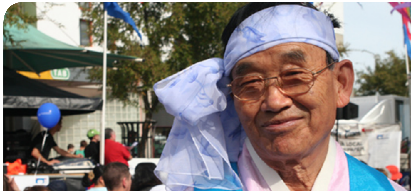
Korean performer at the Campsie Food Festival 2008.