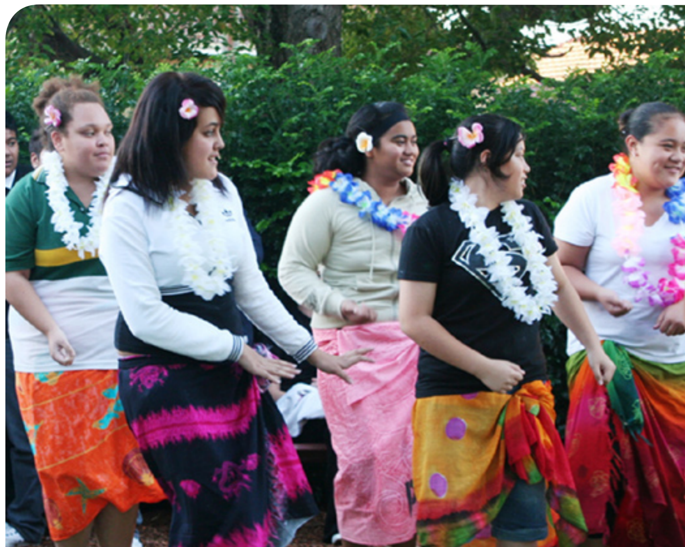
Pacific Cultural Performance at Belmore Youth Resource Centre.

and promote awareness of the Bediagal people. The Aboriginal webpage can be viewed at www.canterbury.nsw.gov.au/aboriginal and it includes: