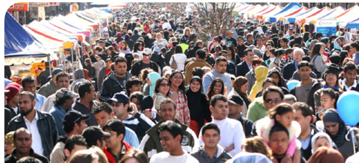
Thousands flock to Lakemba to celebrate the annual Haldon Street Festival, which promotes respect, unity and peace.

This year we also celebrated the tenth Anniversary of our Campsie Food Festival, which coincided with the twentieth anniversary of our Sister City relationship with the city of Eunpyeong-gu. Over 25,000 visitors