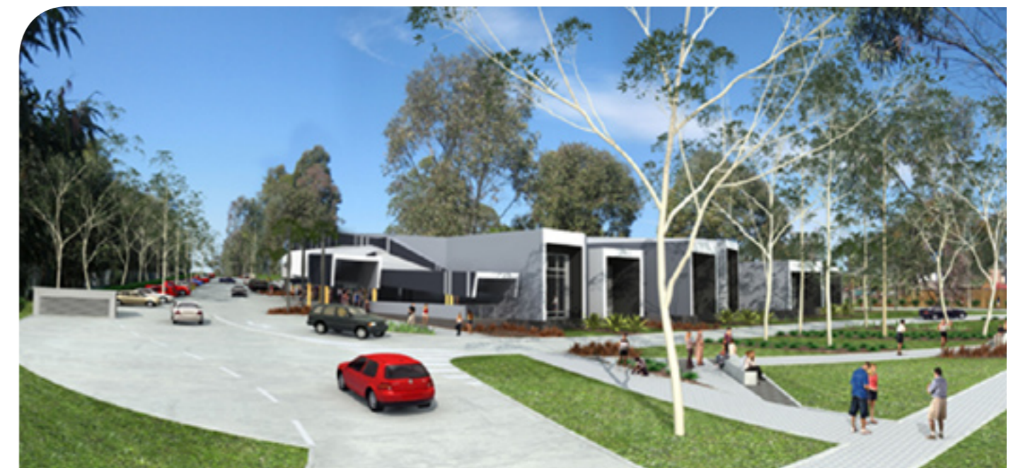
Concept designs of Riverwood Indoor Sport and Recreation Centre.