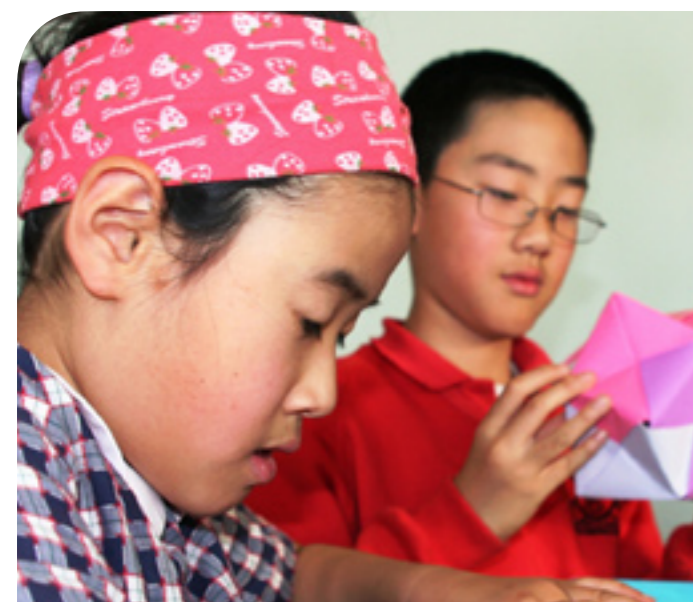
School students participating in our after school care program.

All Children's Services staff continue to participate in local networking and interagency forums in order to maintain up to date with support services and resources available to children and families from CALD background.